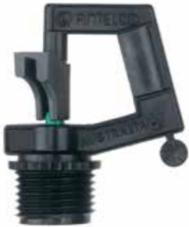
Rotor Rain ® 1/2" Thread