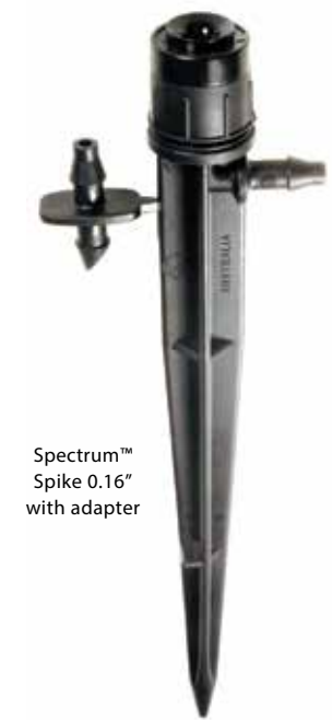
Spectrum™ Spike 0.16" with adapter