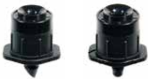
Spectrum™ Barb 0.16"