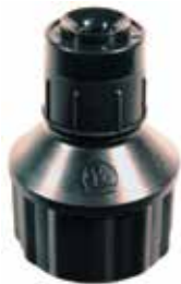
Spectrum™ Thread 1/2"