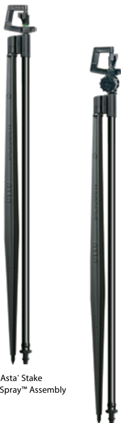
Asta® Stake Rotor Spray™ Assembly