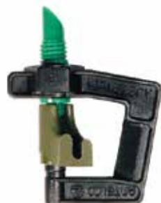
Inverted Rotor Spray™ 10-32 UNF Thread