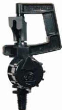
Vari-Rotor Spray™ 10-32 UNF Thread