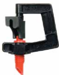
Rotor Spray™ 10-32 UNF Thread