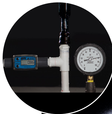
OPTIONAL PRS IN-STEM PRESSURE REGULATION