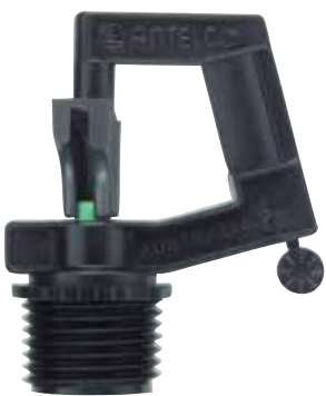
Rotor Rain® 1/2" Thread