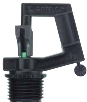
Rotor Rain® 1/2" Thread