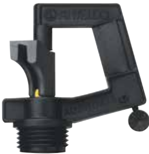
Rotor Rain® 3/8" Thread