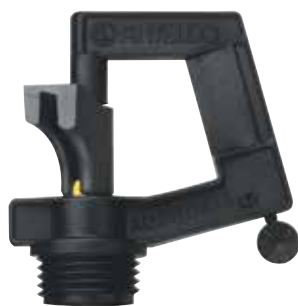
Rotor Rain® 3/8" Thread