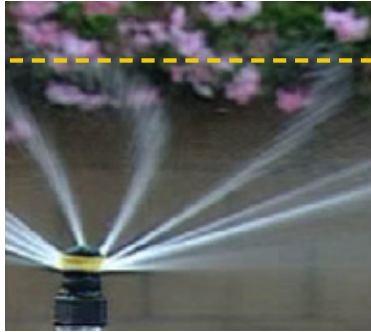
Rain Bird Rotary Nozzles

Stronger streams and lower trajectory makes the rotary nozzle ideal for windy conditions, putting down more water where you need it.