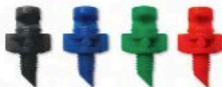
.03" Orifice (Black)

The one-piece jet is the most economical version. It is available in a 90°, 180° and 340° spray pattern.