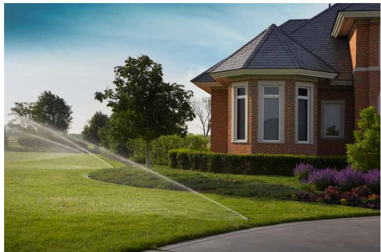
Each sprinkler can be turned off if needed

Website hunterindustries.com | Customer Support 1-800-383-4747 | Technical Service 1-800-733-2823